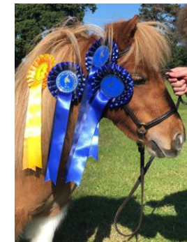
Proud display of rosettes!

I /We would like to take part in the virtual AGM on Monday 30th November